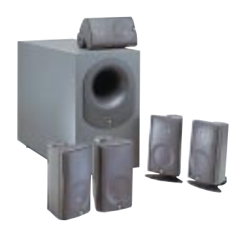
SCS110 system. *

In movie reviews, that's what they call "two thumbs up," isn't it?